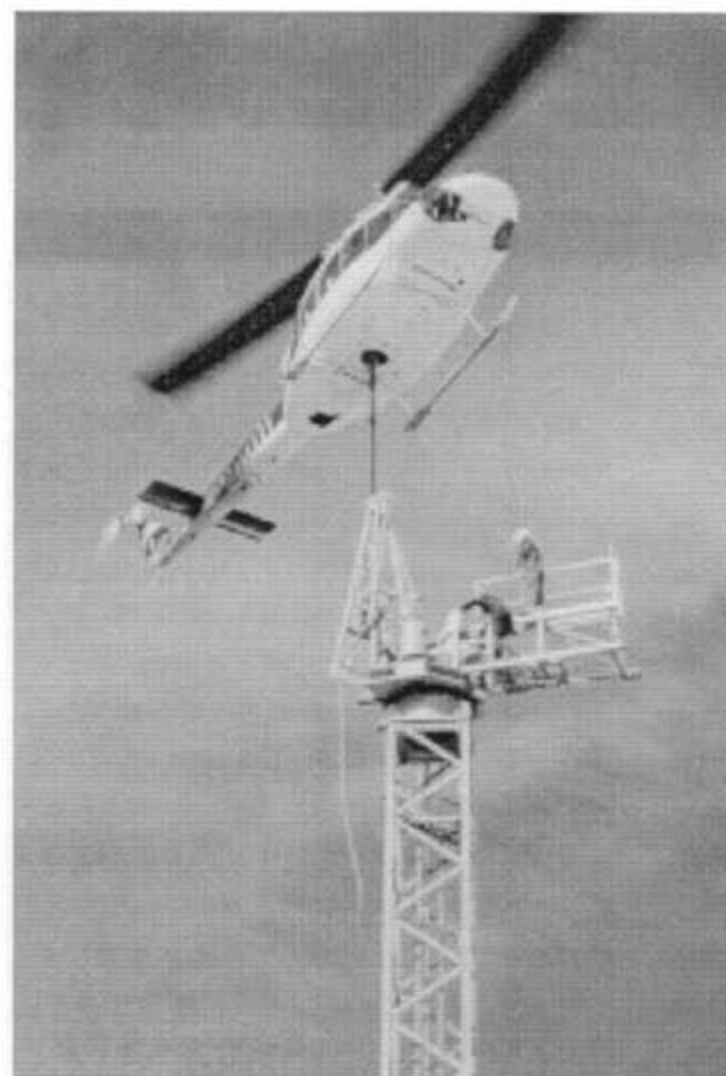
Helicopter cargo hook scales improve safety and productivity of field and air crews.

Our technical staff is comprised of men and women with experience in electronic, mechanical, software and manufacturing engineering. All designs are created using the latest CAD technology, thus increasing design accuracy and decreasing development time.